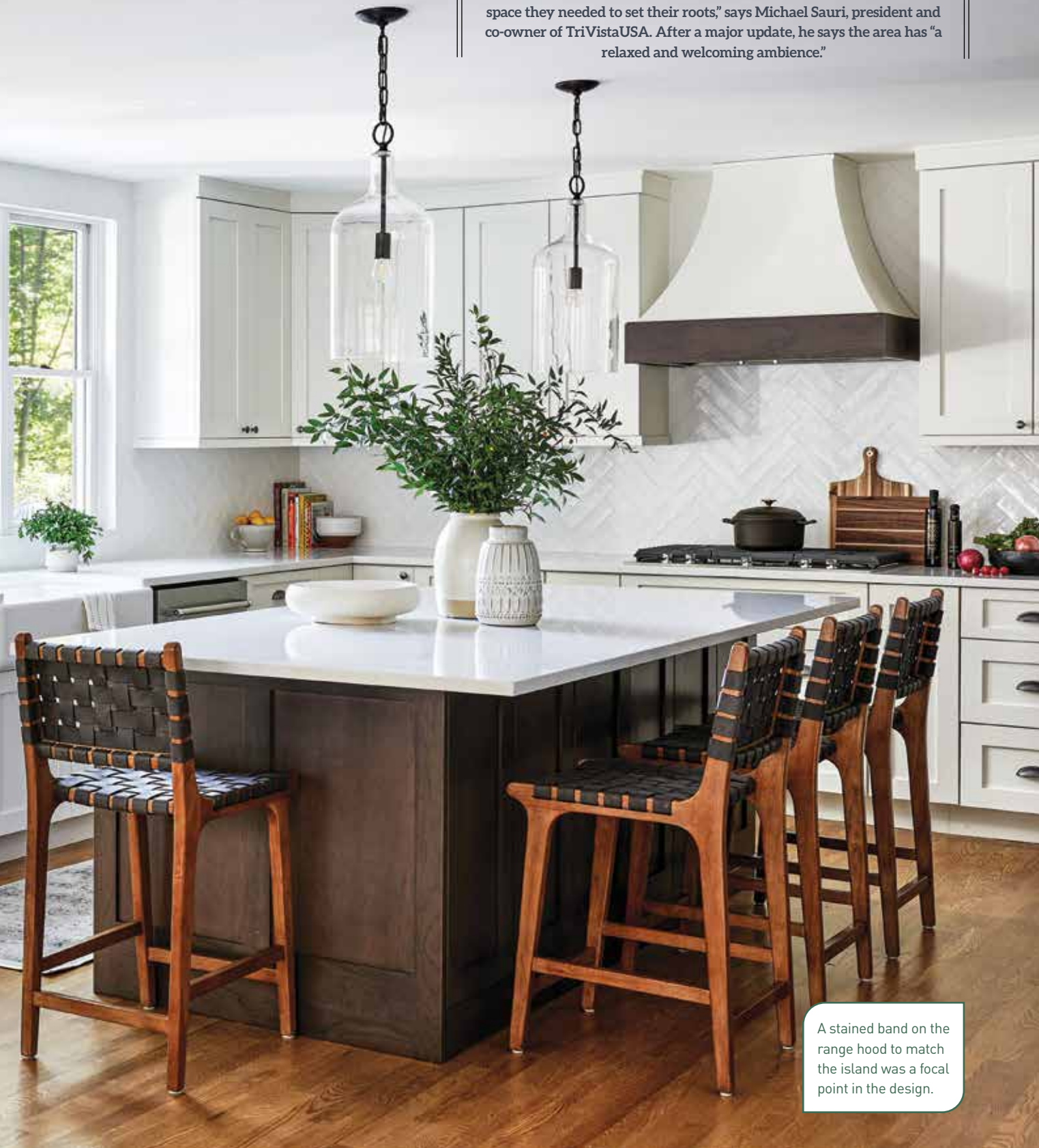
A stained band on the range hood to match the island was a focal point in the design.