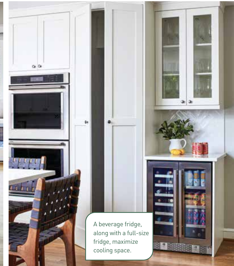
A beverage fridge, along with a full-size fridge, maximize cooling space.