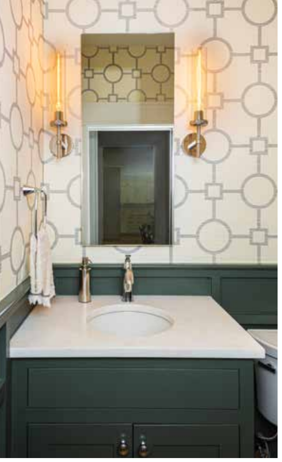
Michael updated the adjacent powder room with neutral shades of pewter green for the cabinet. A complimentary glass cloth wallpaper adorns the wall. Candle sconces frame the mirror, creating a charming space that carries forward the clean lines from the kitchen and living room.

around the six-burner stove. This presented a problem initially with the ventilation system, but he resolved the issue by re-routing it. Now, the island is the focal point of the kitchen.