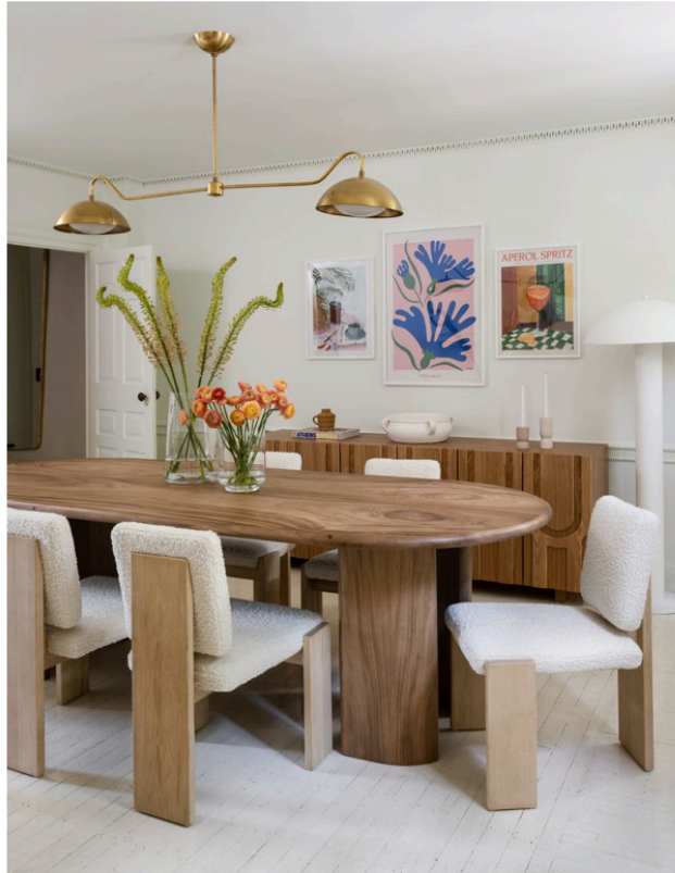
📷 Desiree Burns Interiors