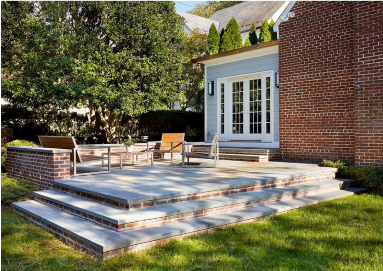
InSite Builders & Remodeling

This deck features low brick railings that play to the home's mostly brick exterior. Red brick is sophisticated and grand, and carrying it over from the house to the deck makes an elevated statement.